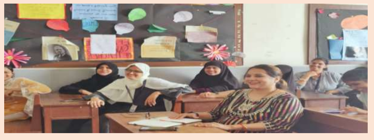
The assembly thus enabled the students and teachers to actively in Marathi language day celebration. Lastly all the student teachers showed there respect towards our country with ending the assembly by national pledge and national anthem.

We was having a very interesting activity for the day. The activity was framed very uniquely that everyone will enjoy it. So, for activity the proverbs are shown on the PPT in Marathi and the audience will tell the meanings of that particular proverb. The students and teachers tried their best to guess the meaning of the proverbs.